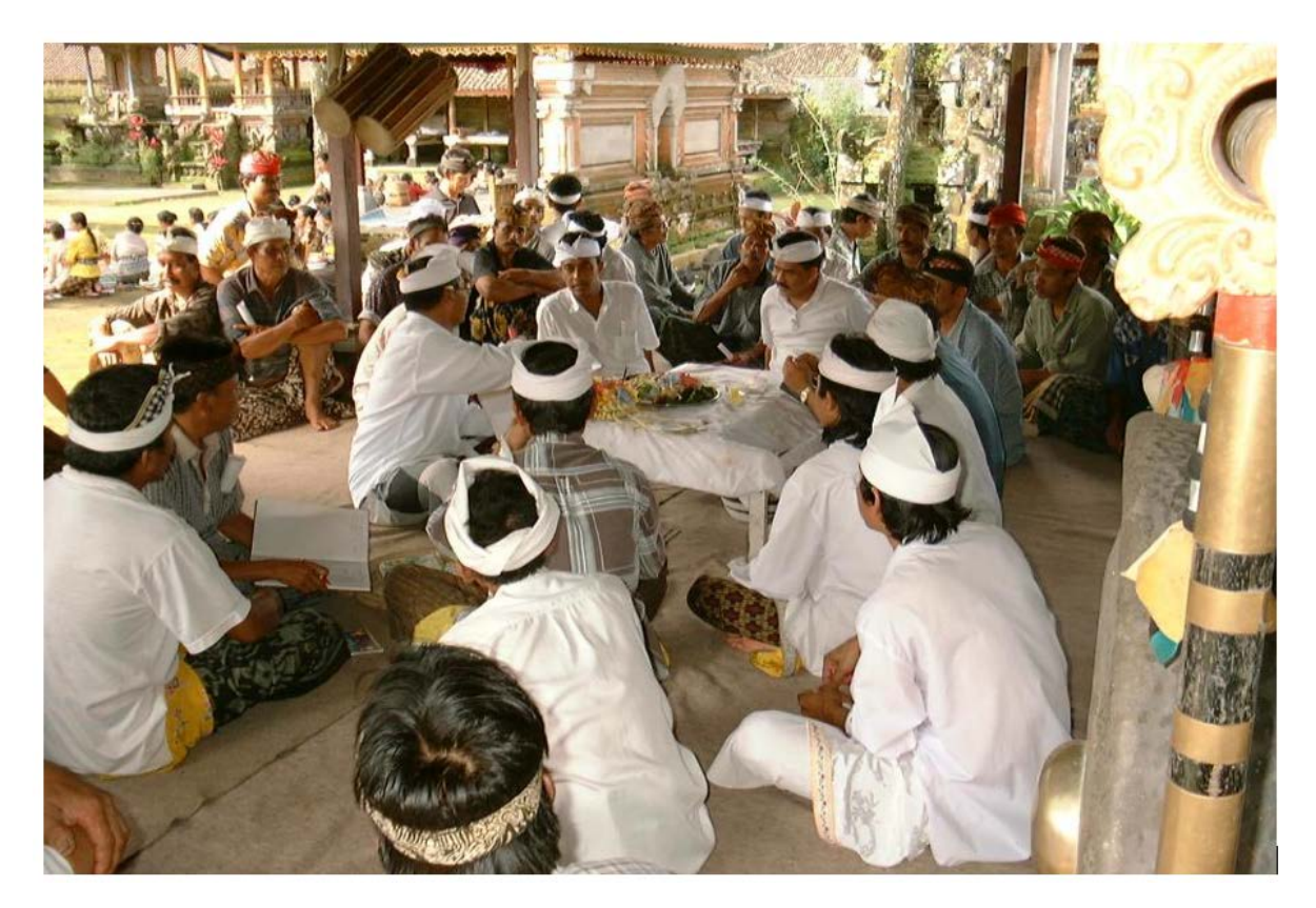
Figure 3: A subak Meeting in a Balinese Water Temple