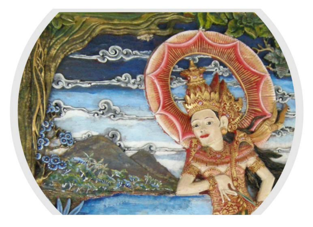
Figure 2: A Depiction of the "Rice goddess" in Balinese Culture